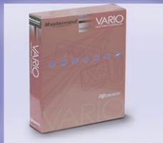
Included RIP software transfers images from PC to printer