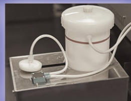
WICS Circulation System ensures beautiful prints on dark garments