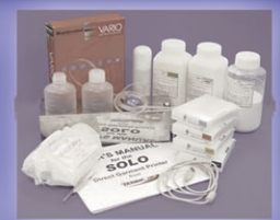
Operator's kit to help get started quickly & keep your printer running