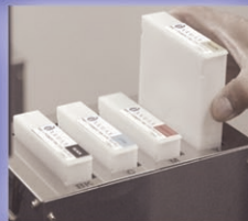
Easy, convenient Cartridge Ink System yields bold colors!