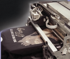
Advanced ink delivery system for quality prints every time

Print area 12.5" x 19.5" · Size 27" x 37" x 20", Includes RIP Software, Adult, child & sleeve platens, maintenance kit. Standard 110v AC current.