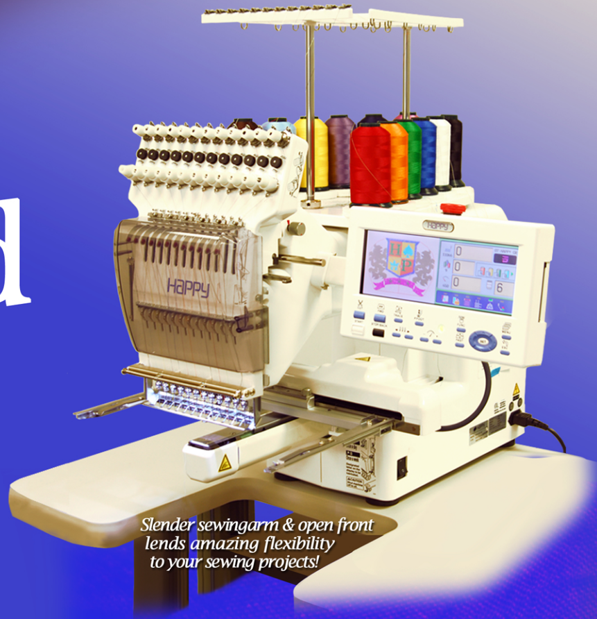
Slender sewingarm & open front lends amazing flexibility to your sewing projects!

The Standard Package is for those who would rather cut out all the extras and get straight to the point: take home a great multi-needle embroidery machine and the essential kit to get up and running. The package the HAPPY Voyager machine, its custom-made stand and key hoops that let you take advantage of Voyager's amazing capability.