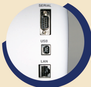
serial, usb, LAN ports