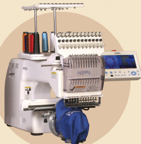
sew on finished caps with optional kit

Features 12 needles • 12"x12" sewing field • 1,000spm operation • included HAPPYLINK connection & design setup software • Included HAPPYLAN network software • Auto trimmer, color change, thread break detection & mending mode • jump to any position by color change or stitch • onboard design edit & cleanup functions • fully adjustable machine settings • Durable construction with tough inner steel/iron casting • built-in bobbin winder • reads compact flash, smart media & other flash memory cards