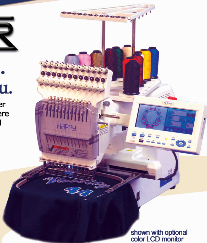
shown with optional color LCD monitor