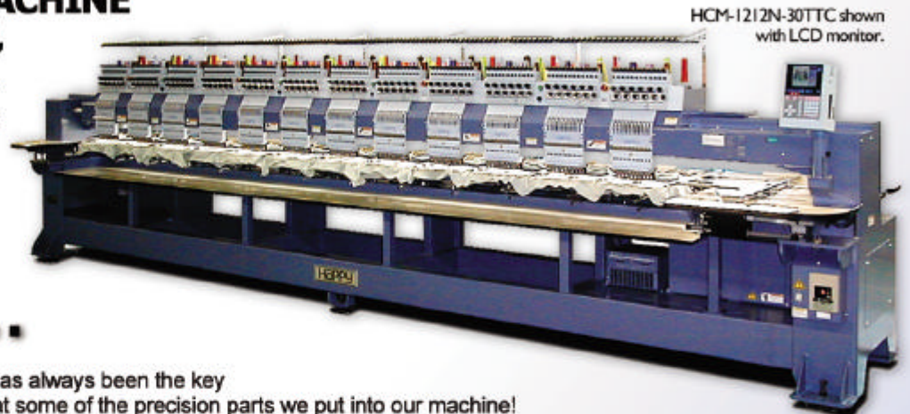
HCM-1212N-30TTC shown with LCD monitor.

It's the ENGINEERING that has always been the key to our success! Take a look at some of the precision parts we put into our machine!